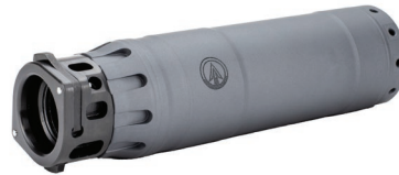
Shown on R30K